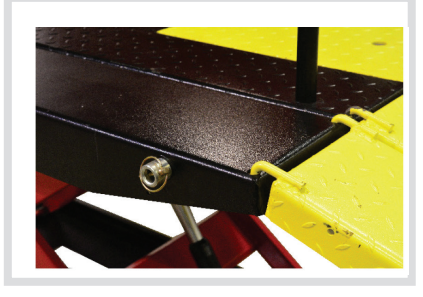
REMOVABLE SIDE SKIRTS 4" / 102MM