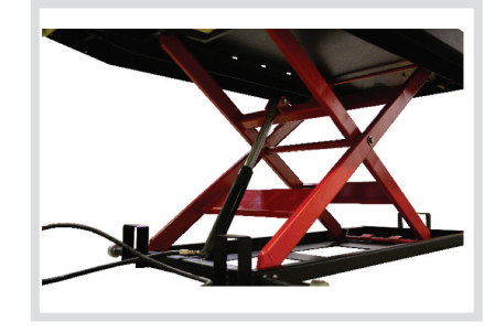
HEAVY DUTY SCISSOR DESIGN PROVIDES BETTER STABILITY WHEN LIFTING HEAVIER EQUIPMENT.