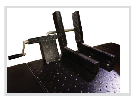
FRONT WHEEL VISE