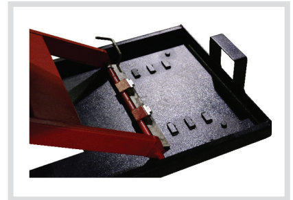
LOCKS SPACED EVERY 3" / 76MM