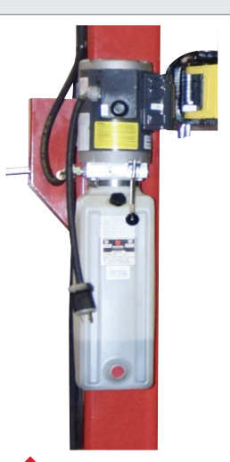
SINGLE POINT LOCK RELEASE