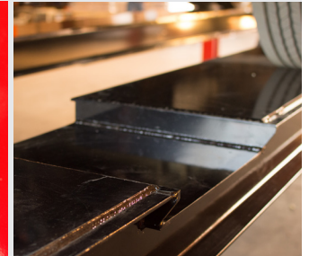
ALIGNMENT AND FLAT DECK AVAILABLE