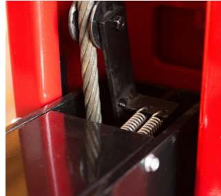
TIME-TESTED CABLE DRIVE

Choose between general service or alignment deck models as well as three lengths to fit your shop's needs. We also offer a range of optional accessories.